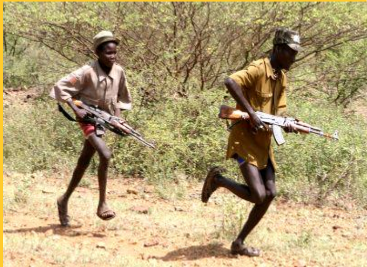
Turkana youth in Northern Kenya. The region is awash with weapons, which fuel the ongoing conflict between communities.

Over the past months, allegations have been made about state ammunition finding its way into civilian hands. A study by the Small Arms Survey provides strong evidence of a systematic unofficial initiative to supply government ammunition to the Turkana pastoralist in Northern Kenya. The police supply almost 50% of the ammunition that circulates illegally in Turkana, ostensibly to allow the pastoralists to defend against rival groups in Sudan and Uganda. This practice not only fuels the armed violence in Turkana but also makes ammunition available for use in crimes ranging from roadside banditry to targeted assassination.